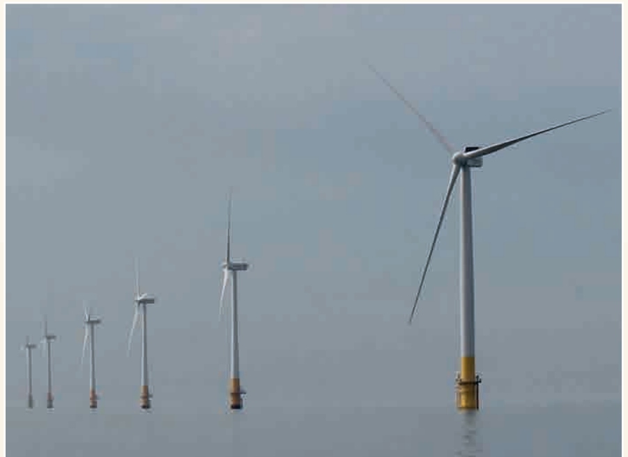
Offshore wind farm turbines