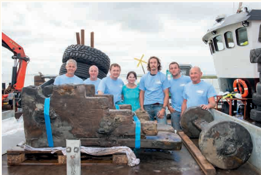
Dive team with gun carriage recovered from the wreck of the London (1665)